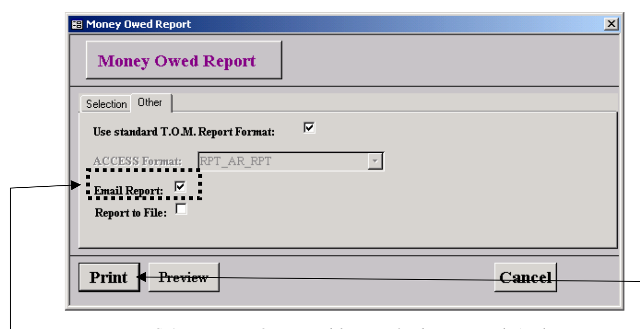
Figure G-1 - Instructing T.O.M. to Email the Money Owed Report as a File Attachment.

Most your T.O.M. Reports allow you to attach the reports as a file to an email. The following is an example of how you would do this. For this example we chose to email a Money Owed Report as an Excel Spreadsheet. First we would select the Money Owed Report and enter reporting parameters. Then we would tell T.O.M. that we want to email the report as a file attachment. To do this we click on the Email Report Check box found in the Other Section of the Money Owed Report Screen and then click the Print button (Figure G- 1). NOTE: Clicking the Preview button will NOT cause the report to be emailed as a file attachment.